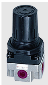
PRESSURE REGULATOR UNIT