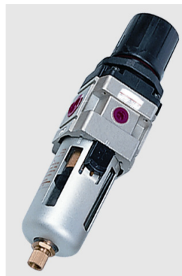
STACKING REGULATOR AND FILTER UNIT